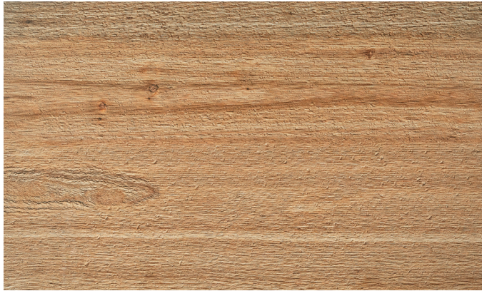
Rough Sawn Natural Cedar