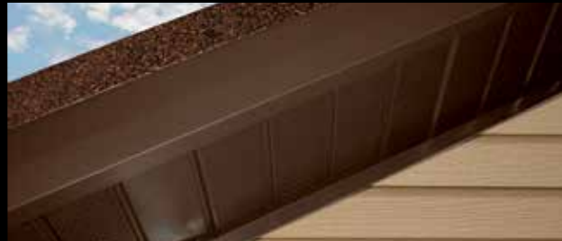
Steel Soffit & Fascia