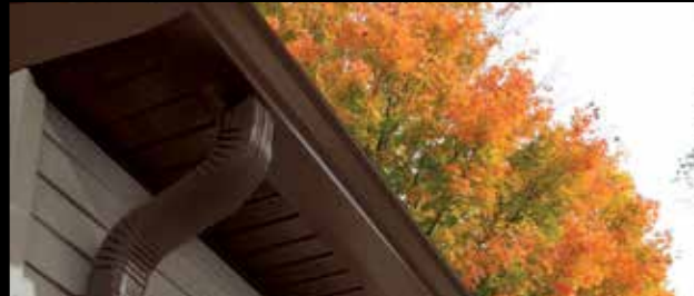
Steel Gutter Systems